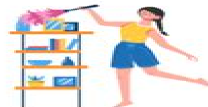
organize a bookshelf