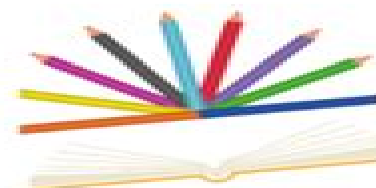
use an adult coloring book